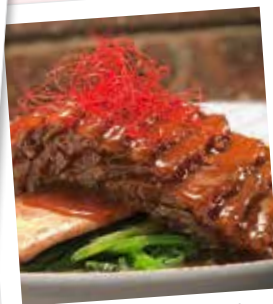
法式紅酒燜澳洲與牛肋排 Braised Australian Wagyu Short Rib with Red Wine